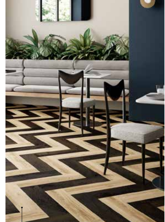
Blackjack Oak 22229