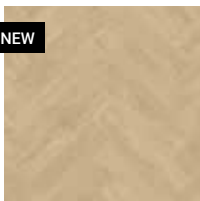
51329 15,8 x 63,2 cm