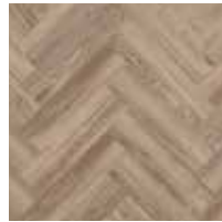
22937 15,8 x 63,2 cm