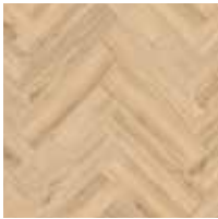
22220 15,8 x 63,2 cm