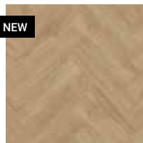
51824 15,8 x 63,2 cm