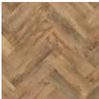
54852 15,8 x 63,2 cm