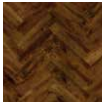
54880 15,8 x 63,2 cm