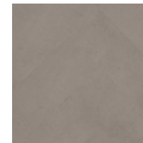
46926 15,8 x 63,2 cm