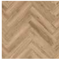
22229 15,8 x 63,2 cm